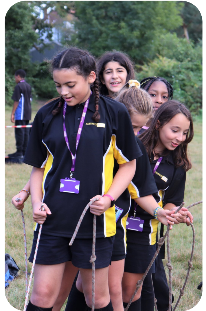
Year 7s team building and problem solving during their PSA funded enrichment day in 2023

There is another meeting with the Year 7 team in the Autumn. This is a social evening to help parents and carers get to know us better, but it also does provide another opportunity to raise any issues that may have arisen in the first few weeks.