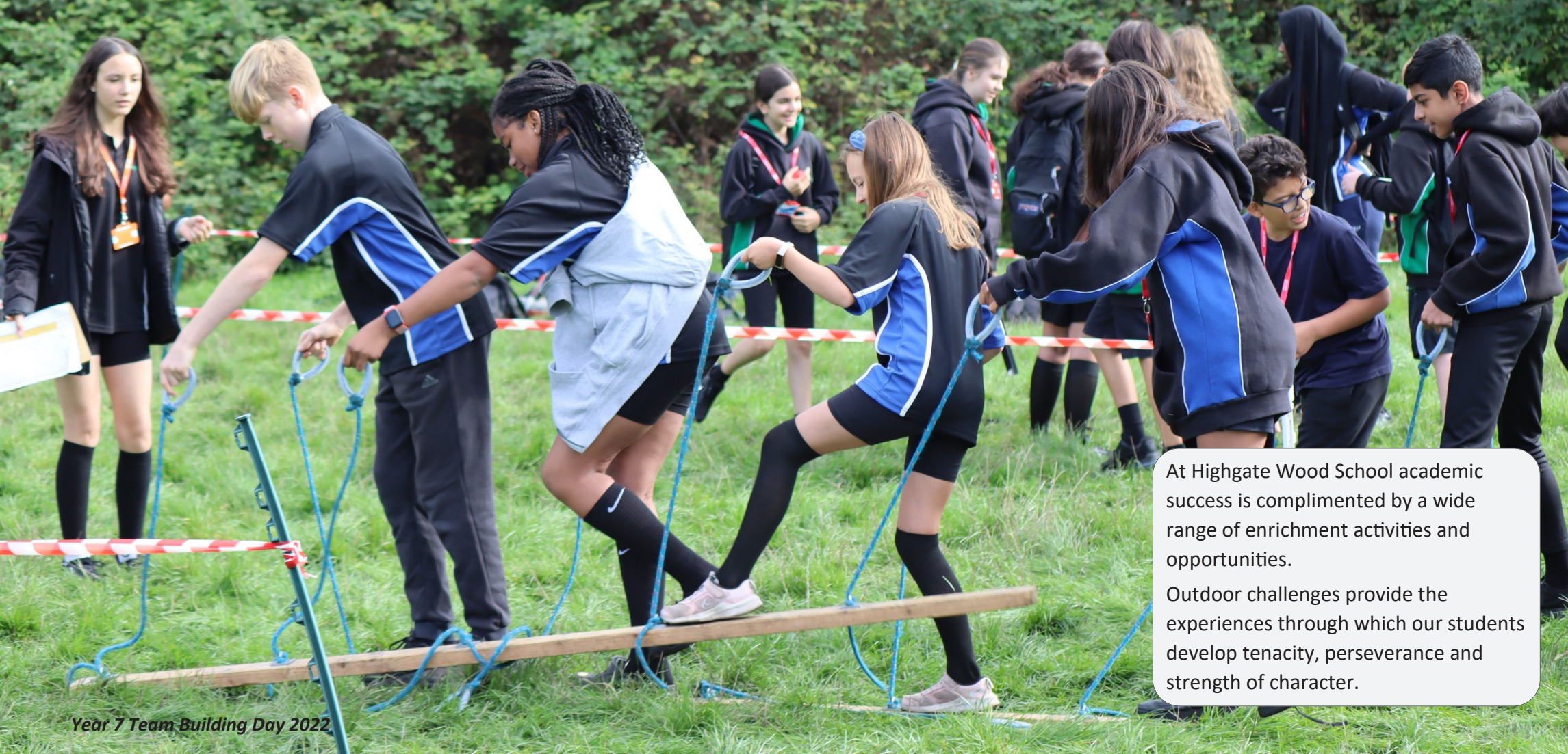
Year 7 Team Building Day 2022

At Highgate Wood School academic success is complimented by a wide range of enrichment activities and opportunities.