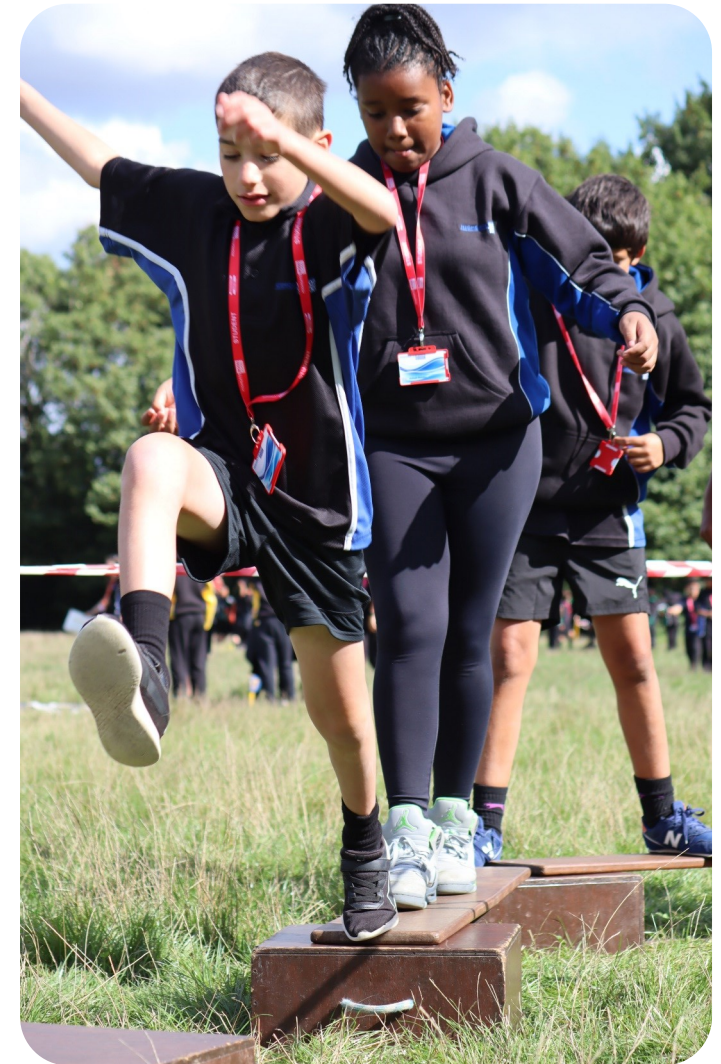
Year 7s team building and problem solving during their PSA funded enrichment day in 2022

There is another meeting with the Year 7 team in the Autumn. This is a social evening to help parents and carers get to know us more, but it also does provide another opportunity to raise any issues that may have arisen in the first few weeks.